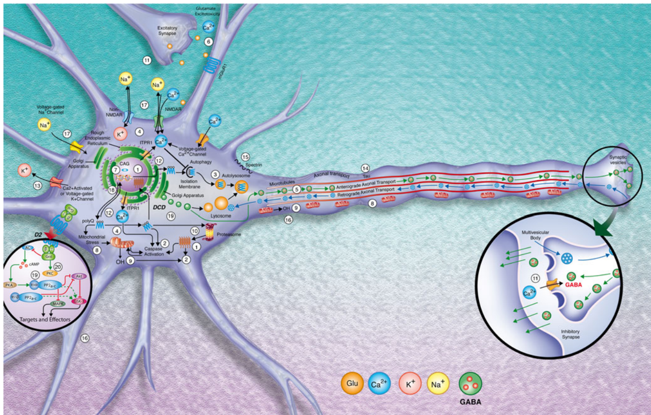
Fig. 1 Most common molecular pathways identified triggering neurodegeneration in the SCAs. DCD dark cell degeneration (SCA2, SCA3, SCA7, SCA28). 1 Aggregation (SCA1, SCA2, SCA3, SCA6, SCA7, SCA8, SCA17, SCA35, DRPLA). 2 Caspase activation (SCA1, SCA2, SCA3, SCA6, SCA7, SCA8, SCA12, SCA17, DRPLA). 3 Autophagy (SCA1, SCA2, SCA3, SCA6, SCA7, SCA17, DRPLA). 4 \text{Ca}^{2+} homeostasis/signaling alterations (SCA1, SCA2, SCA6, SCA14, SCA15, SCA16). 5 Disruption of axonal transport and vesicle trafficking (SCA5, SCA11, SCA27). 6 Glutamate excitotoxicity (SCA1, SCA2, SCA3, SCA6, SCA12). 7 Interference with transcription (SCA1, SCA2, SCA3, SCA6, SCA7, SCA8, SCA12, SCA17, DRPLA). 8 Mitochondrial impairment (SCA1, SCA2, SCA3, SCA6, SCA17, SCA8,

SCA17, SCA28, DRPLA). 9 Oxidative stress (SCA2, SCA3, SCA7, SCA12). 10 Alterations of proteasome degradation (SCA1, SCA3, SCA5, SCA7, SCA14). 11 Early synaptic neurotransmission deficits (SCA1, SCA2, SCA3, SCA5, SCA6, SCA7, SCA8, SCA14, SCA17, SCA31, DRPLA). 12 Unfolded protein response (UPR) (SCA1, SCA2, SCA3, SCA6, SCA7, SCA8, SCA17, DRPLA). 13 Potassium channel dysfunction (SCA13, SCA19/22). 14 Tau phosphorylation dysregulation (SCA11). 15 Neuronal membrane skeleton defects (SCA5). 16 Neurite alterations (SCA1, SCA10, SCA14). 17 Voltage-gated \text{Na}^+ channel dysregulation (SCA27). 18 Proteostatic disruption (SCA26). 19 Protein phosphatase 2A (PP2A) activity dysregulation (SCA1, SCA2, SCA12). 20 Protein kinase C (PKC) activity deficits (SCA1, SCA14)